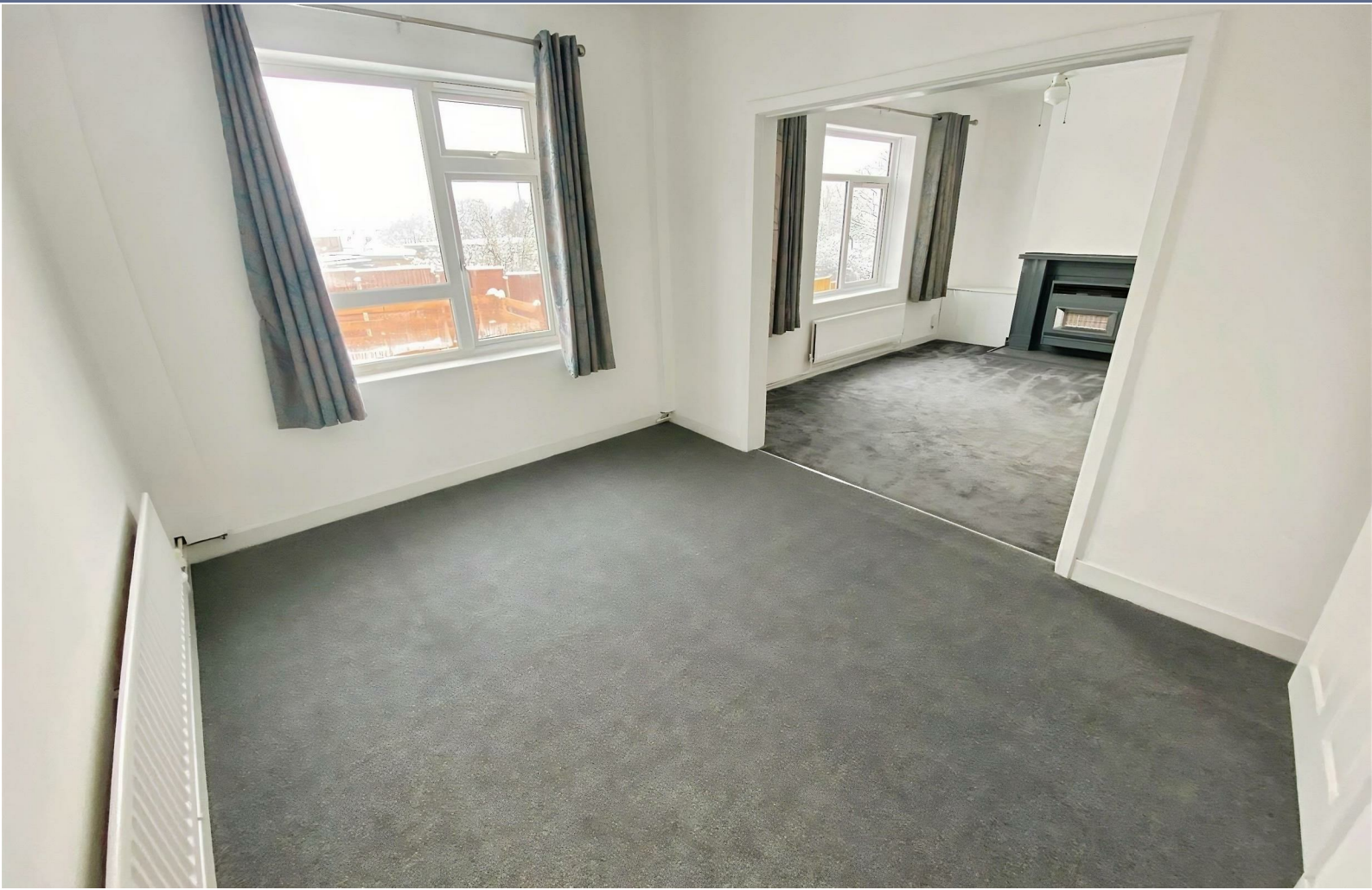
Lodge Road Stoke- On- Trent